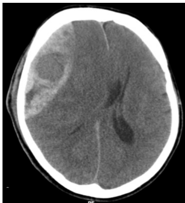
Figure 2 CT scan demonstrating an extradural haematoma.

controlled with direct pressure while continuing the procedure.